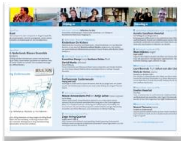
Flyer Reflections festival