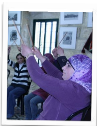
Percussion with sticks