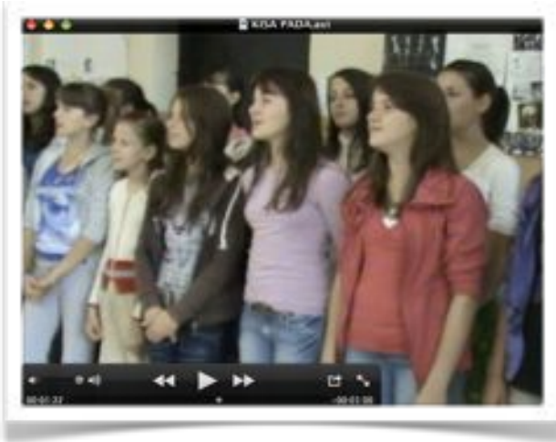
Video Srebrenica, BiH