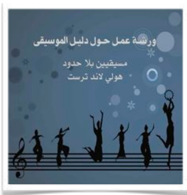
Music Workshop Leader's Manual Manual in Arabic