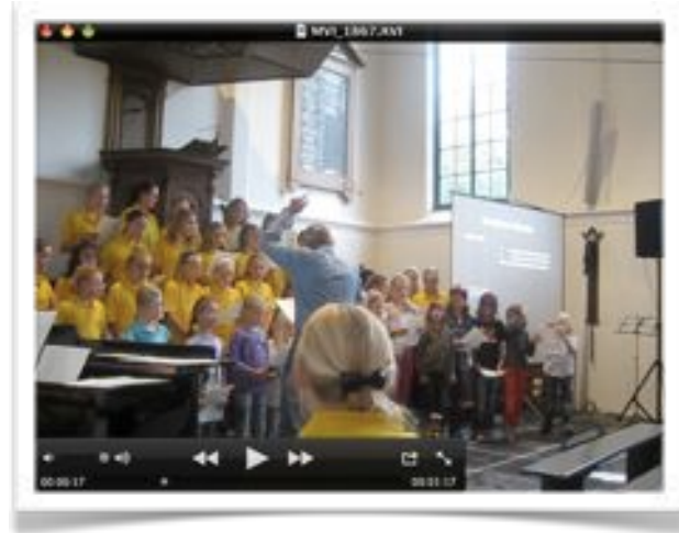
Concert in Waterland, NL