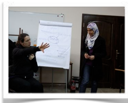
Pedagogy and didactics