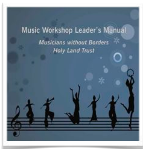
Music Workshop Leader's Manual Manual for trainees about workshops and (musical) leadership