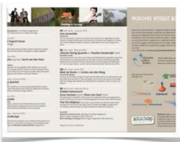
Flyer Reflections festival